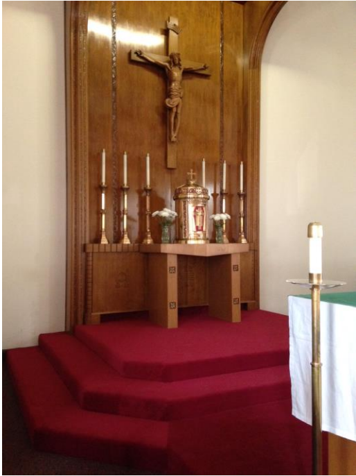
Sanctuary – Sacred Heart Catholic Church - Patterson

Purchasing an Annual Memorial Candle in honor of a loved one or for a special intention is a wonderful way to remember your loved one while supporting the parish and beautifying the sacred space of our church.